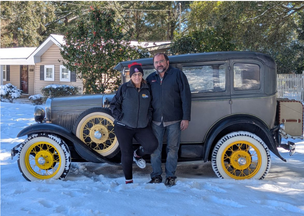
January 21 Snow Day photo