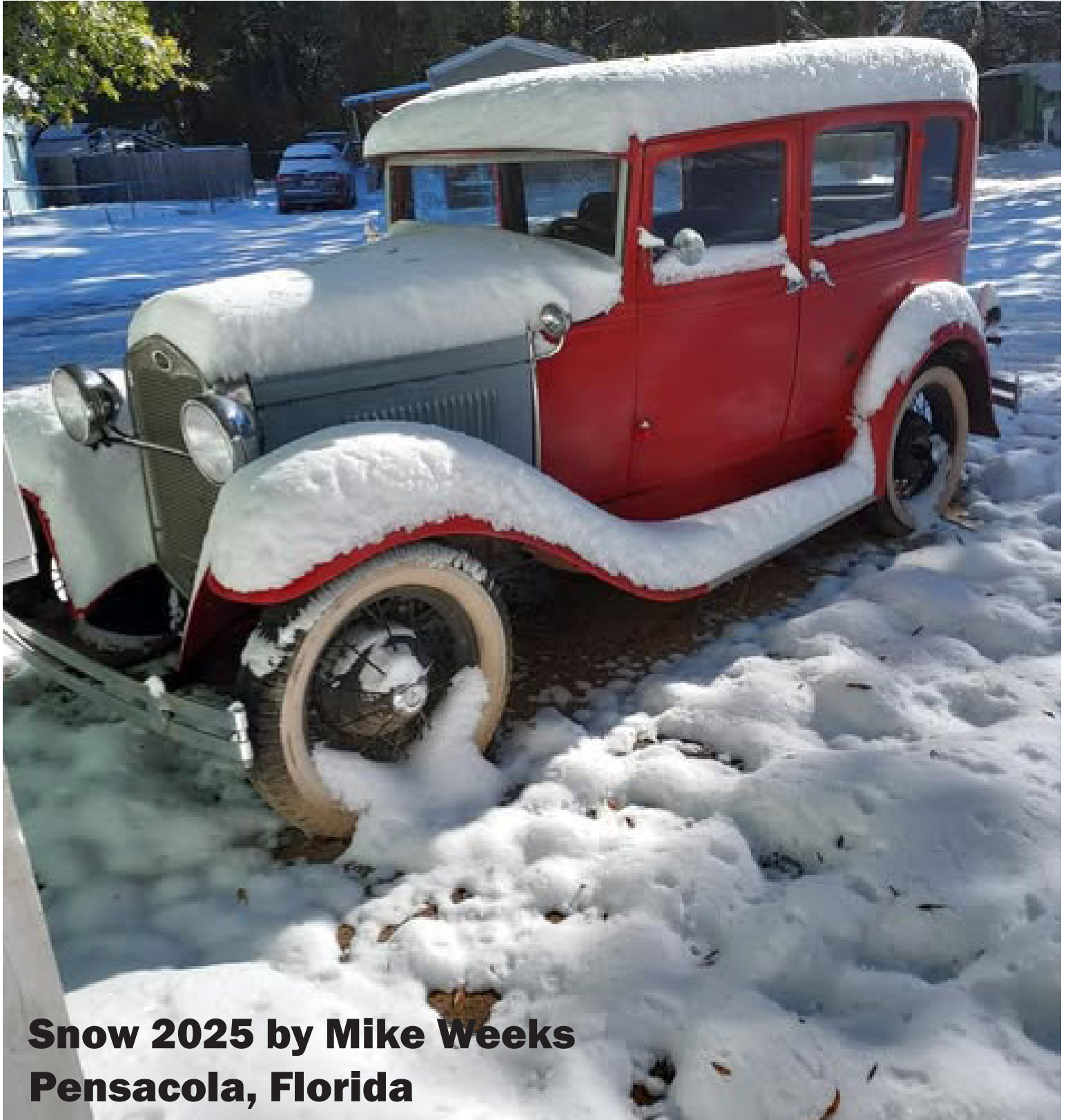
Snow 2025 Pensacola, Florida