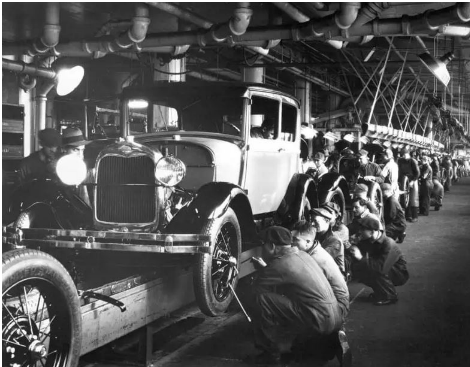
Ford Model A production