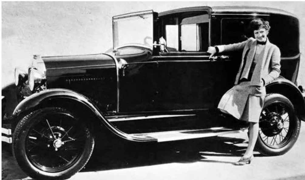
A rare 1929 Ford Model A Towncar with Joan Crawford posing. Only 1,198 of this model ever left the assembly line