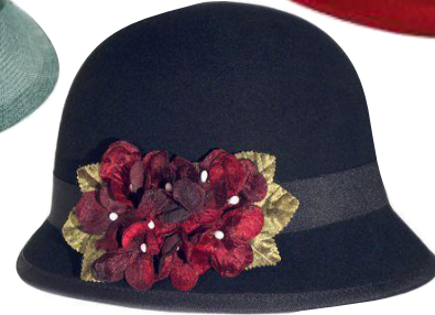
Good luck and I hope this will entice you to start enjoying the Model A "look".