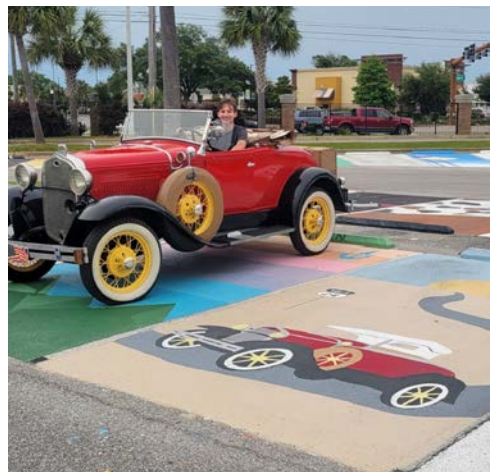
On January 16 Nicholas Collins posted on Facebook: 94 years ago today, this beautiful vehicle rolled off the Baton Rouge assembly line... and she's still going strong!