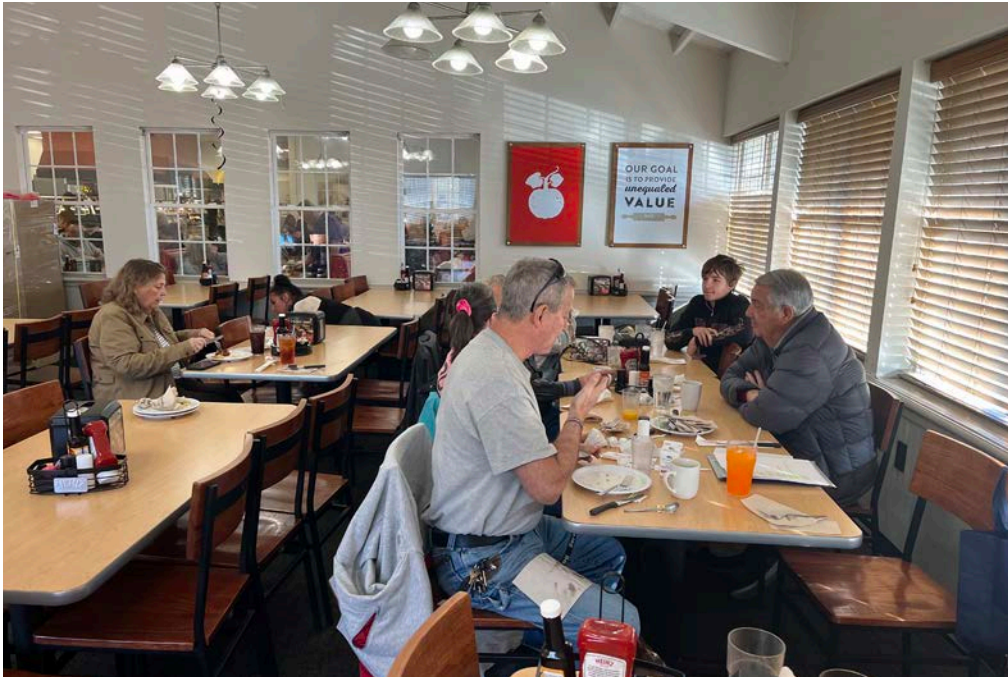
January Club breakfast was held at the Golden Corral in Pensacola with 11 in attendance.