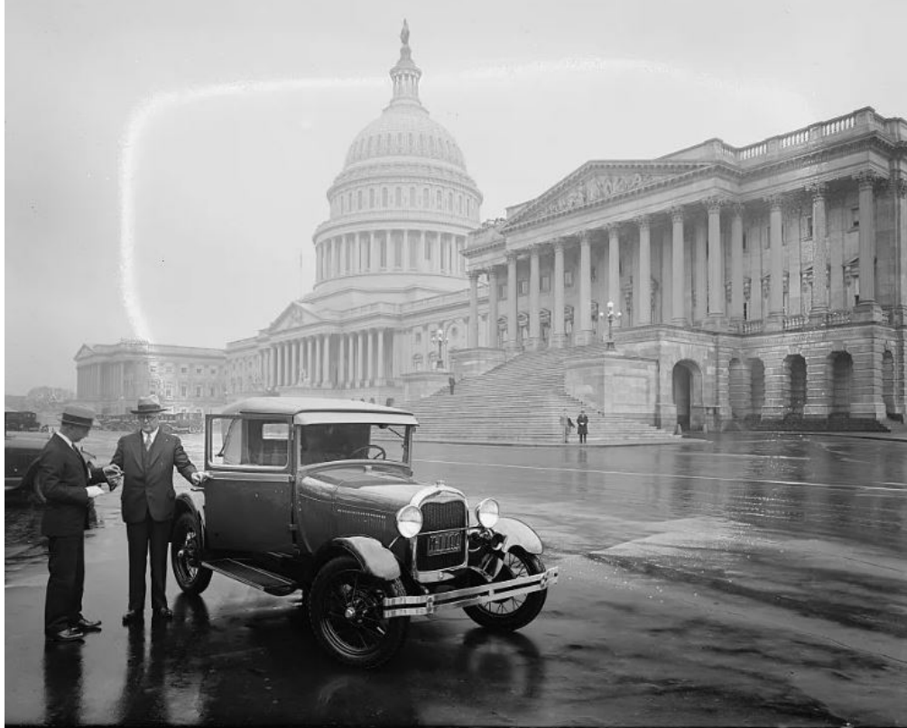
A new Ford Model A at the Capital

Another 539,786 wore truck bodywork and cabriolets made up 60,715 of that production figure. The rarest Model A Fords include the convertible sedan, of which 5,085 were built, and the Towncar. Only 1,198 of those ever left the factory.