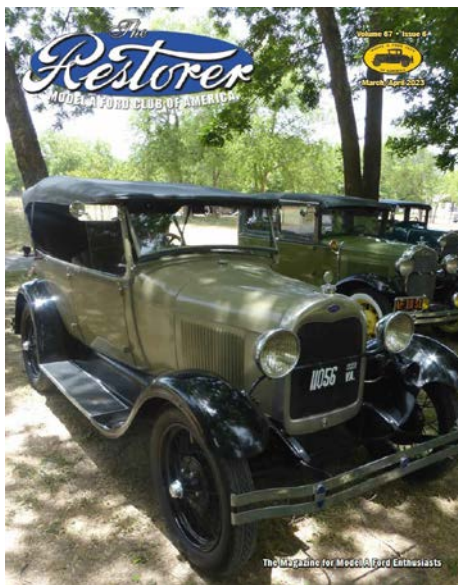
Our award winning magazine "The Restorer"

MAFCA is dedicated to the restoration, preservation and enjoyment of the Ford Model A and AA cars and trucks, as manufactured from 1928 through 1931. We are an active, family-friendly organization whose members share a passion for these historic vehicles, plus other aspects of life in that era, such as fashions.