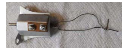
The shaft has been straightened

The bent shaft. On the opposite end of the shaft there is a hole for the purpose of hooking a length of bailing wire through it and pulling the shaft to extend it and then tying it off out of the way when the transmission is removed. This will ensure the shaft does not become bent when the transmission is reinstalled.