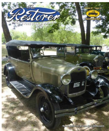
Our award winning magazine "The Restorer"

MAFCA is dedicated to the restoration, preservation and enjoyment of the Ford Model A and AA cars and trucks, as manufactured from 1928 through 1931. We are an active, family-friendly organization whose members share a passion for these historic vehicles, plus other aspects of life in that era, such as fashions.