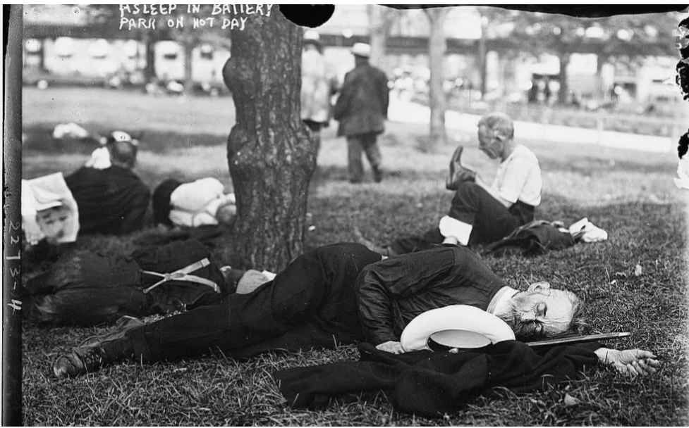
Asleep in Battery Park on hot day; Asleep in Battery Park on hot day; between ca. 1910 and ca. 1915; 1 negative : glass ; 5 x 7 in. or smaller