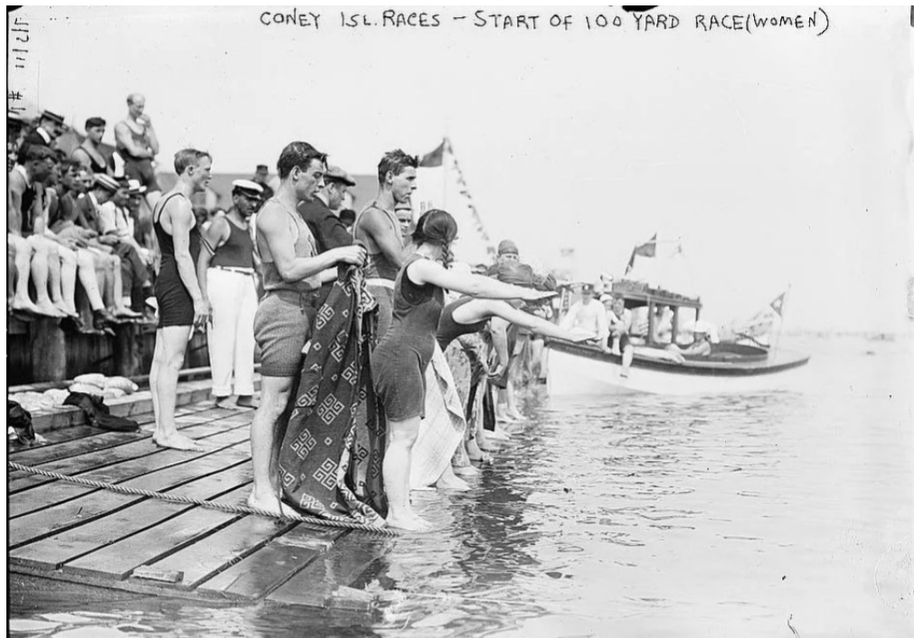
Coney Isl Races-start of 100 yd. (women's); between ca. 1910 and ca. 1915; 1 negative : glass ; 5 x 7 in. or smaller

The heat affected nearly every part of city life. Horses pulling wagons through Manhattan streets had to be watered constantly. Factory workers collapsed on the job. Elderly residents suffered badly in the overheated apartments, and