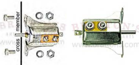
The Chinese product The A&L product p/n 19410 p/n 19411 $10.95 $64.95

Bratton's Antique Auto carry both the A&L product and the Chinese product. Inflation has increased the A&L product price significantly. Photos are from Bratton's on-line 2023 catalog.