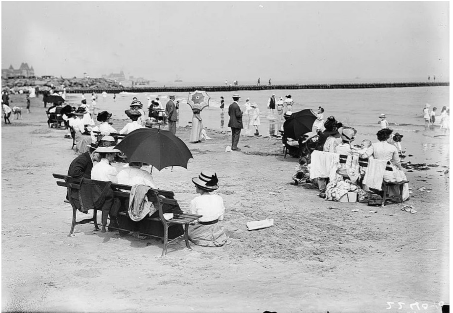
Coney Island, the Beach; Bain News Service, publisher; between ca. 1910 and ca. 1915; 1 negative : glass ; 5 x 7 in. or smaller; Library of Congress