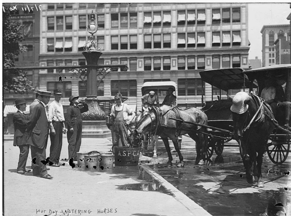
Hot day — watering horses 1911 July 7 (date created or published later by Bain); Bain News Service, publisher; 1 negative: glass; 5 x 7 in. or smaller; Library of Congress

hospitals quickly filled with heat victims.