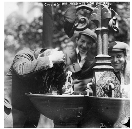
picnic baskets, filled water jugs, and searched for shade wherever they could find it.

Model A owners would soon continue that tradition. One can easily imagine a family in 1929 loading their Ford for a Sunday drive simply to catch cooler air beyond the city streets.