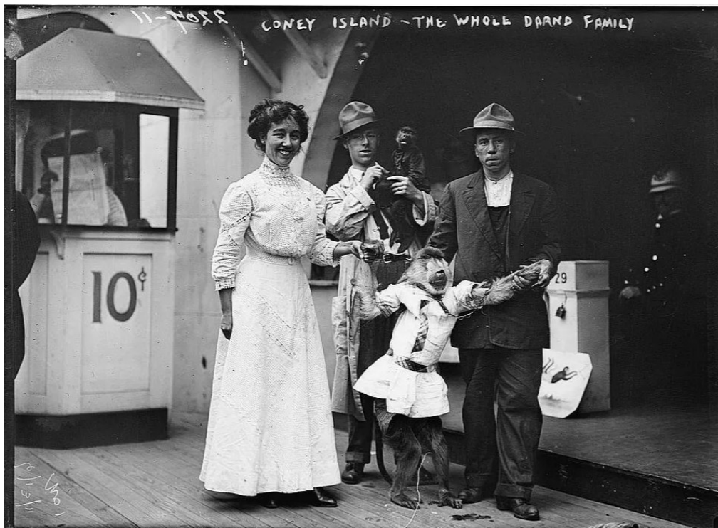
Coney Island, the Whole Darnd Family (LOC); Bain News Service, publisher; between ca. 1910 and ca. 1915; 1 negative : glass ; 5 x 7 in. or smaller; Library of Congress