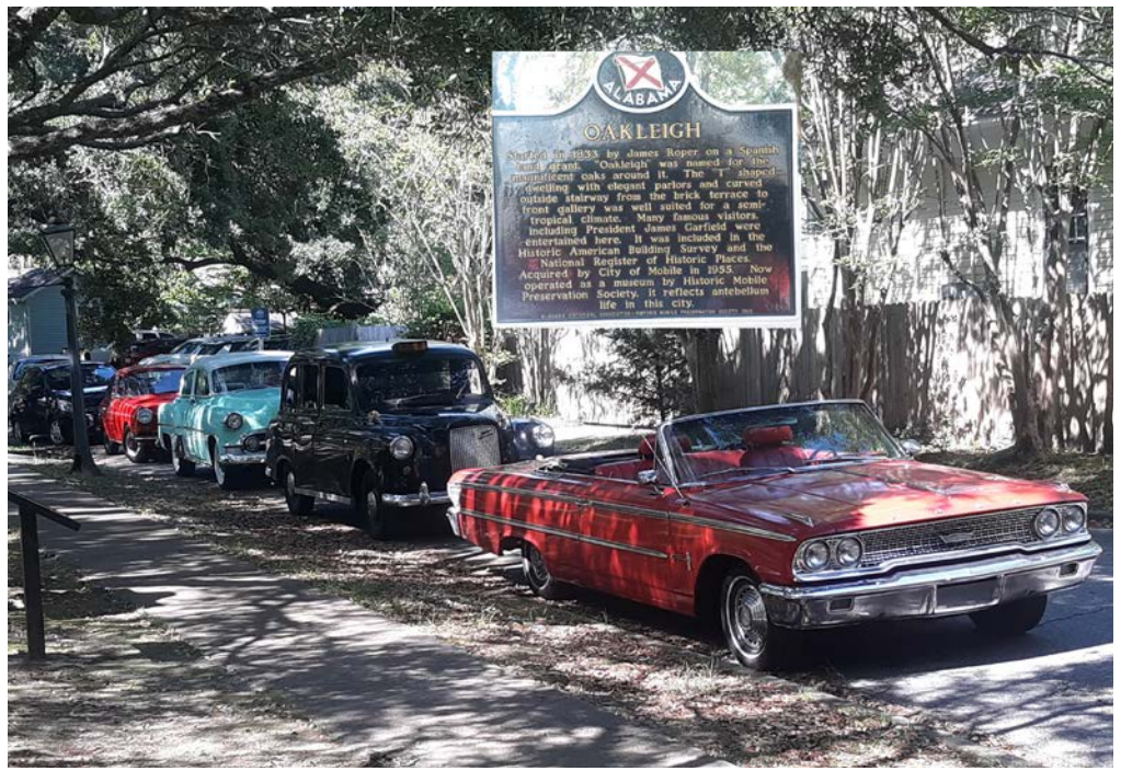
4 cars were available for actors to ride in May 16th at the Oakleigh Boyington Oak Festival.