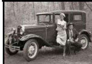
Bonnie and Clyde